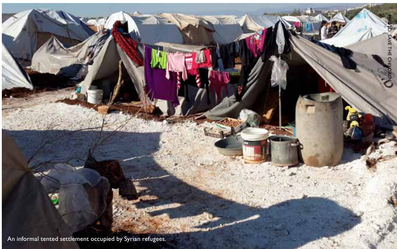
An informal tented settlement occupied by Syrian refugees.

In addition to these challenges, many refugee children, like their counterparts inside Syria, are dealing with trauma and high levels of emotional distress. Many will have seen suffering, some will have seen death or been victims of violence themselves. 96 Others may have made the journey out of Syria alone, with their parents dead, detained or whereabouts unknown. 97 We know from talking to teachers and caregivers in