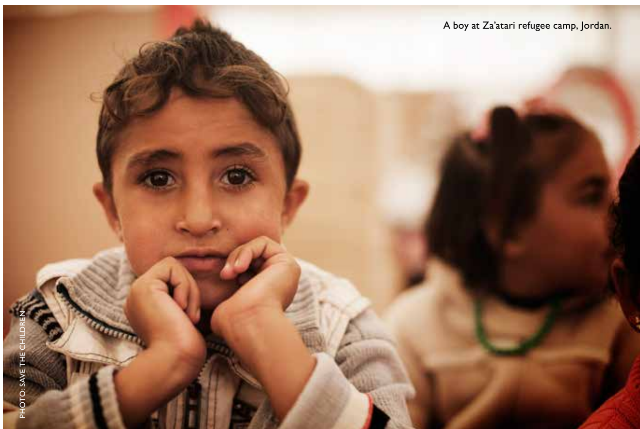
A boy at Za'atari refugee camp, Jordan.