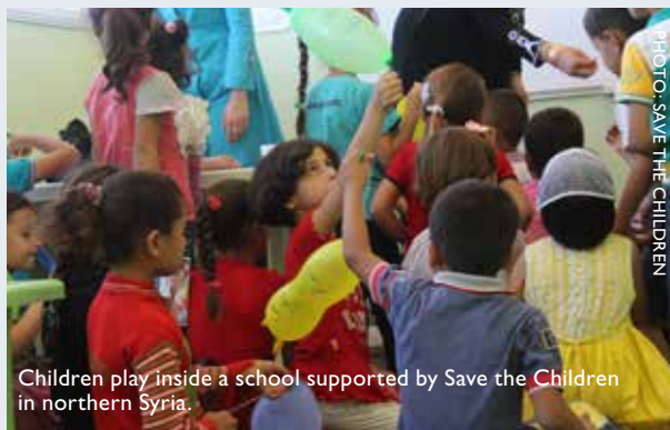
Children play inside a school supported by Save the Children in northern Syria.

Save the Children’s approach is to provide an advisory role to the community we work with, who are empowered to make decisions about their children’s education and who ultimately decide on what action should be taken. In this situation, given the high risk to children by continuing to use the school, Save the Children and the community together took the decision to suspend activities at the school.