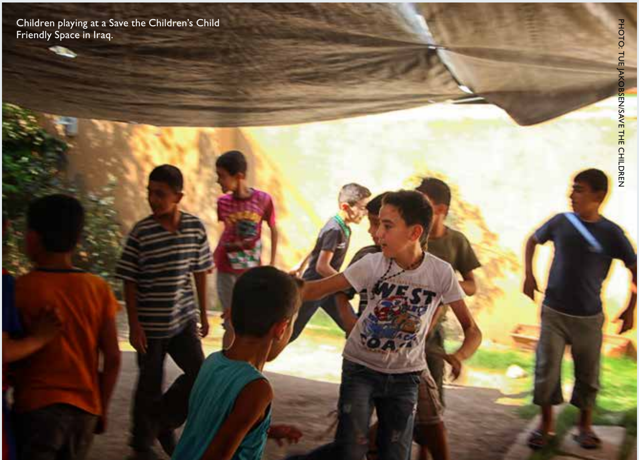
Children playing at a Save the Children’s Child Friendly Space in Iraq.