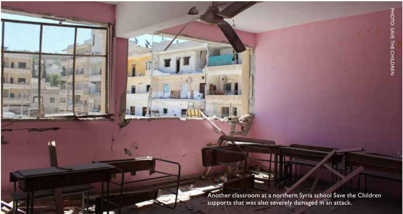
Another classroom at a northern Syria school Save the Children supports that was also severely damaged in an attack.