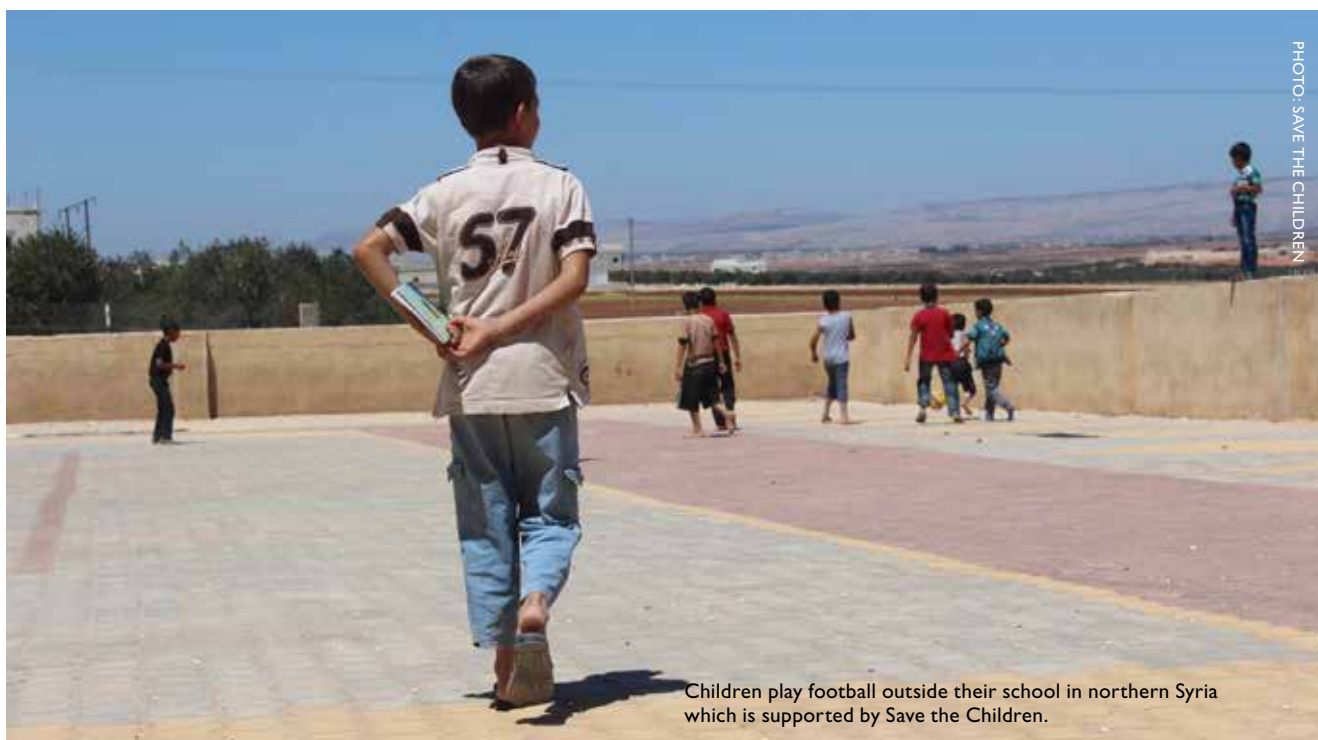
Children play football outside their school in northern Syria which is supported by Save the Children.