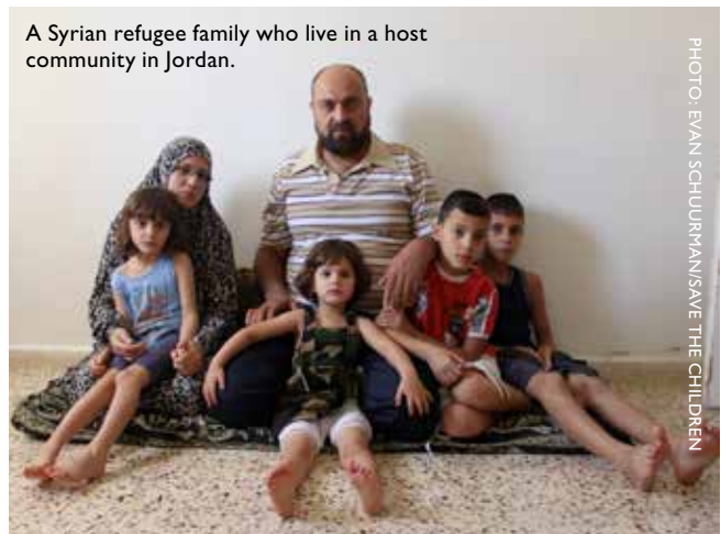
A Syrian refugee family who live in a host community in Jordan.

For various reasons, some refugees register with United Nations High Commissioner for Refugees