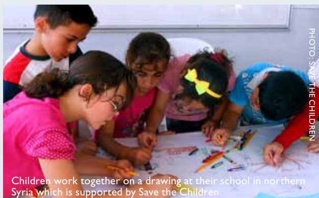
Children work together on a drawing at their school in northern Syria which is supported by Save the Children

In such situations, Save the Children’s Education and Child Protection Service Delivery Contingency Plan kicks in. This is part of our Conflict-Sensitive Education Operating Protocols, which include guidance on community-driven education and child protection, safety, security and well-being. The Contingency Plan sets out the steps that should be taken to ensure the continuation of education and child protection under various insecure circumstances, while the Safety, Security and Wellbeing Protocol provides a series of steps that should be taken to prepare, manage and respond to incidents.