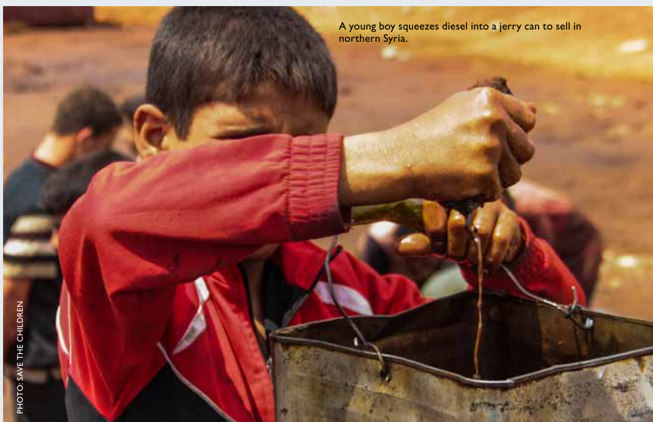
A young boy squeezes diesel into a jerry can to sell in northern Syria.

The reasons for children dropping out of school are complex and require an integrated child protection and education response by humanitarian actors. Drop-out data from Save the Children's schools reveal that, overall, equal numbers of boys and girls are dropping out of school. However, in some locations where child labour is more common noticeably higher numbers of boys are dropping out. For girls, insecurity is often a key reason for leaving education, while the prospect of early marriage looms as a solution to their families' economic and security concerns, and as a way of 'protecting' them from the risk of abuse.