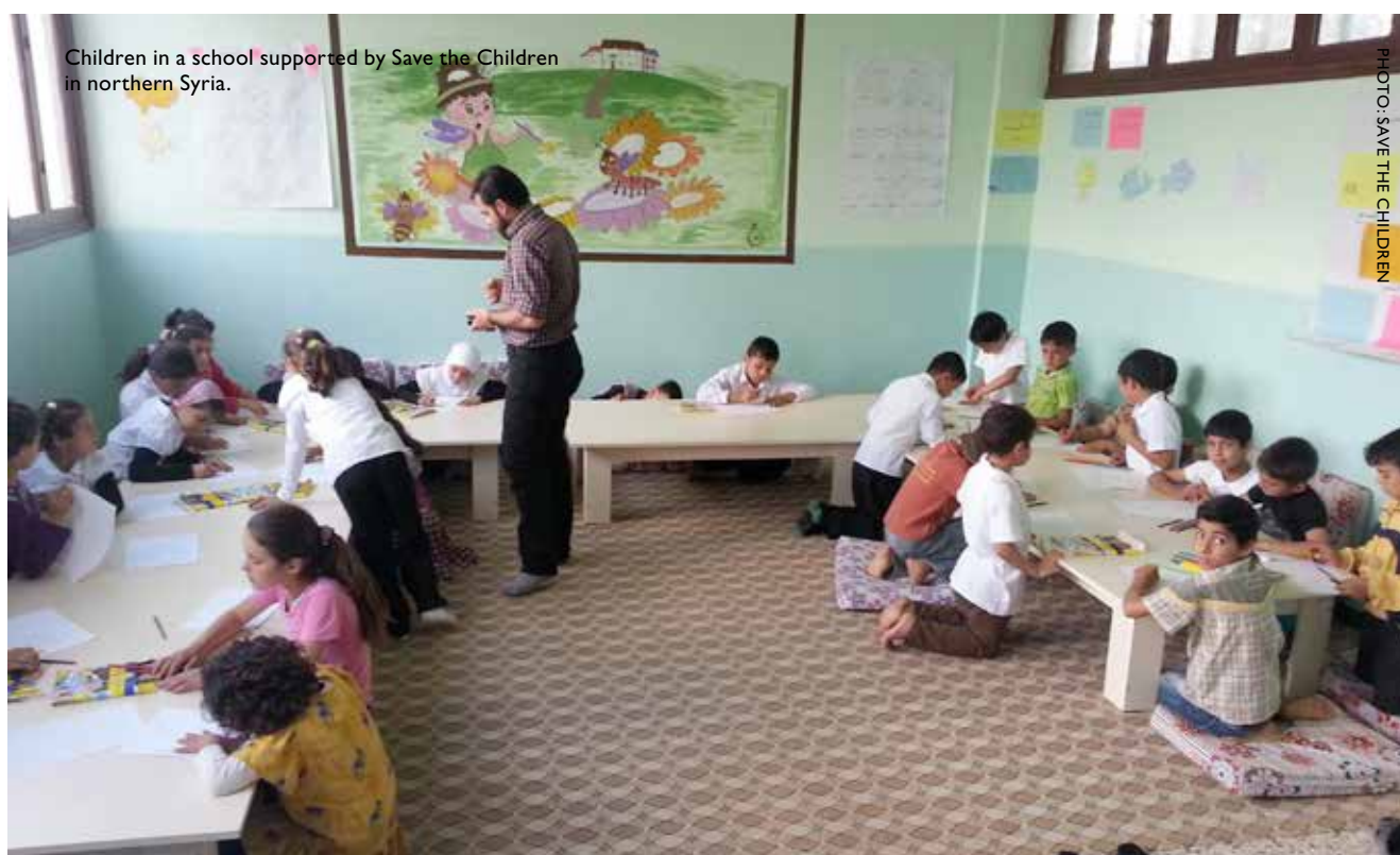
Children in a school supported by Save the Children in northern Syria.

Longer-term psychosocial distress can be minimised when teachers and communities are empowered to address issues around children's well-being in a way that also builds resilience to traumatic experiences.