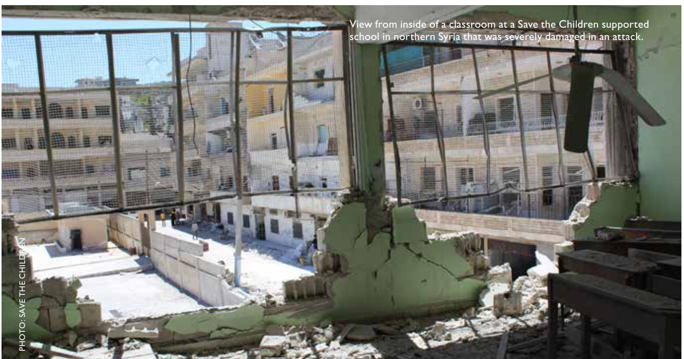
View from inside of a classroom at a Save the Children supported school in northern Syria that was severely damaged in an attack.

This section provides a snapshot of the current education situation, particularly in northern Syria. In this area, an in-depth education sector assessment is yet to be done, resulting in a gap in information and reliable data. With this in mind, we look at what Save the Children is doing to address the complex education challenges inside Syria and what needs to be done under the NLGI and by the international community to scale-up a targeted education response.